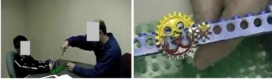
Fig. 1 Tutoring setting and example configuration of gears. Note. Picture at left illustrates the typical seating arrangement for the tutor and student; the gear set is located on the table closer to the student. Each student was given a set of 8-tooth, 24-tooth, and 40-tooth gears. The picture at right illustrates an example configuration of gears (an 8-tooth and a 24-tooth gear)